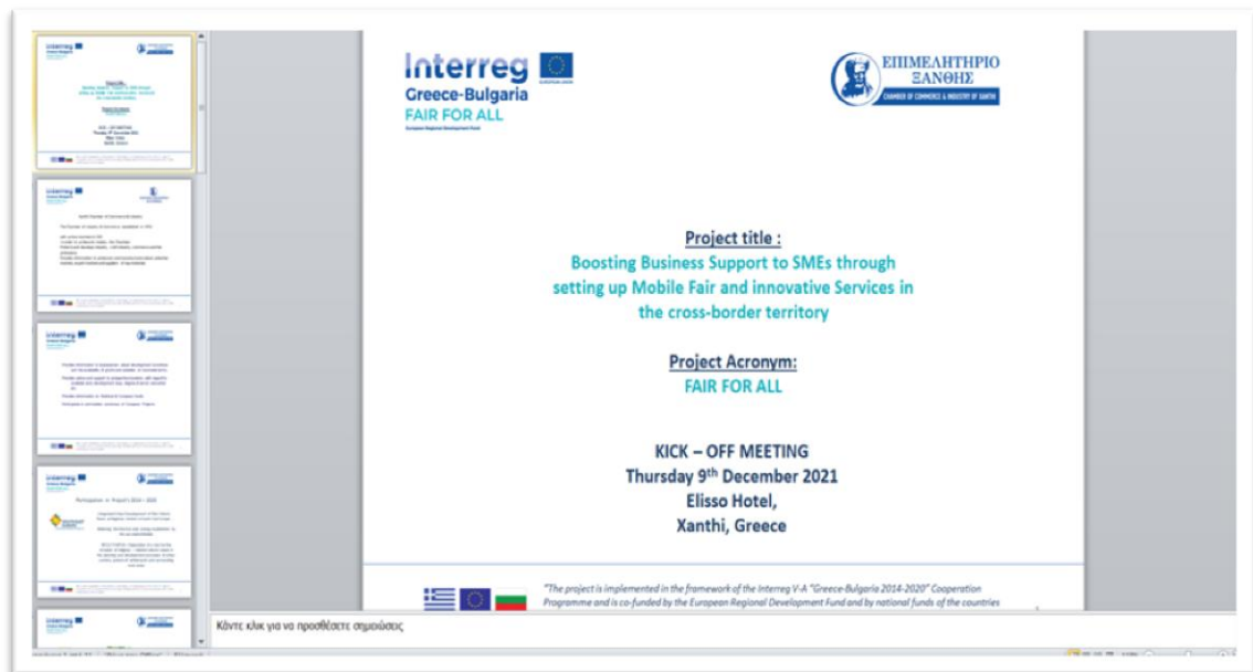
Figures 1-5 : Beneficiaries presenting their organizations and activities in the project.